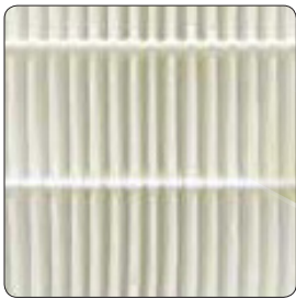
High performance fully synthetic media