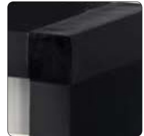
Fully potted media with a robust extruded ABS plastic frame

For more information, contact your Parker Hannifin Gas Turbine Filtration representative: